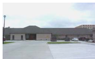
Main Office Building in the Celtic Centre Complex

Along with these buildings, The Celtic Centre will be comprised of several more new buildings to be constructed in the future for long term lease to commercial businesses.